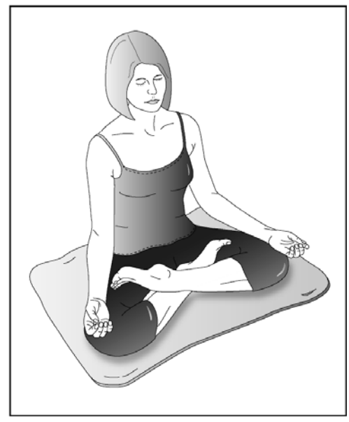
Full Lotus position. Maintain a straight back. Use of a cushion, shawl, mat, and /or blanket for comfort may be helpful.