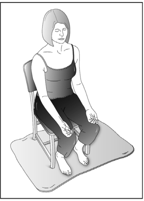
Seated position with chair. Maintain a straight back.