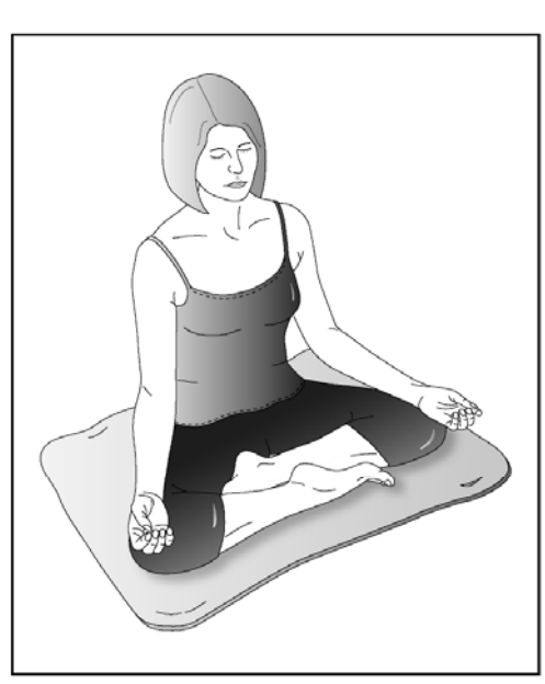
Cross-legged position. Maintain a straight back. Use of a cushion, shawl, mat, and /or blanket for comfort may be helpful.