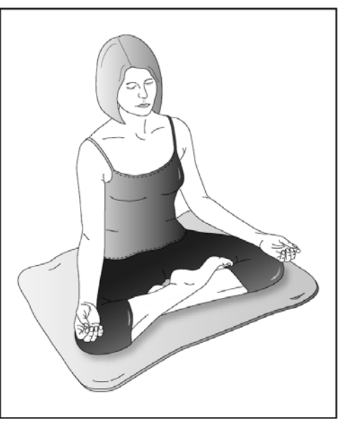
Half-Lotus position. Maintain a straight back. Use of a cushion, shawl, mat, and /or blanket for comfort may be helpful.