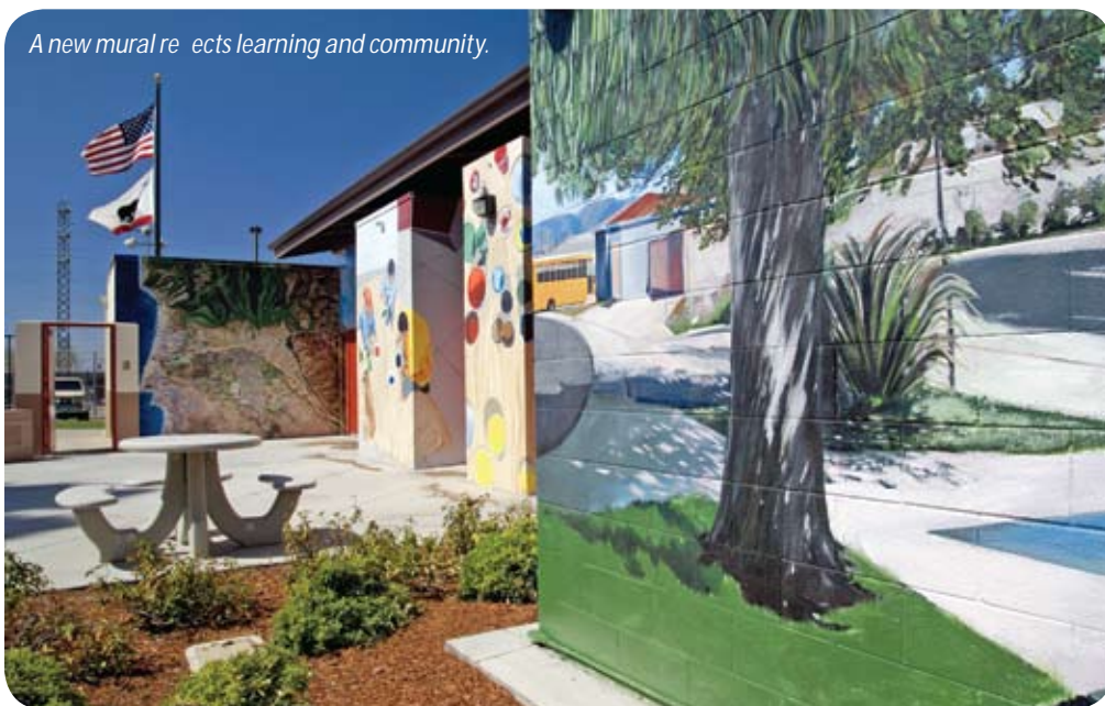
A new mural reflects learning and community.

The 1,500 square-foot mural is located in the gated courtyard of the Atkinson Center building.