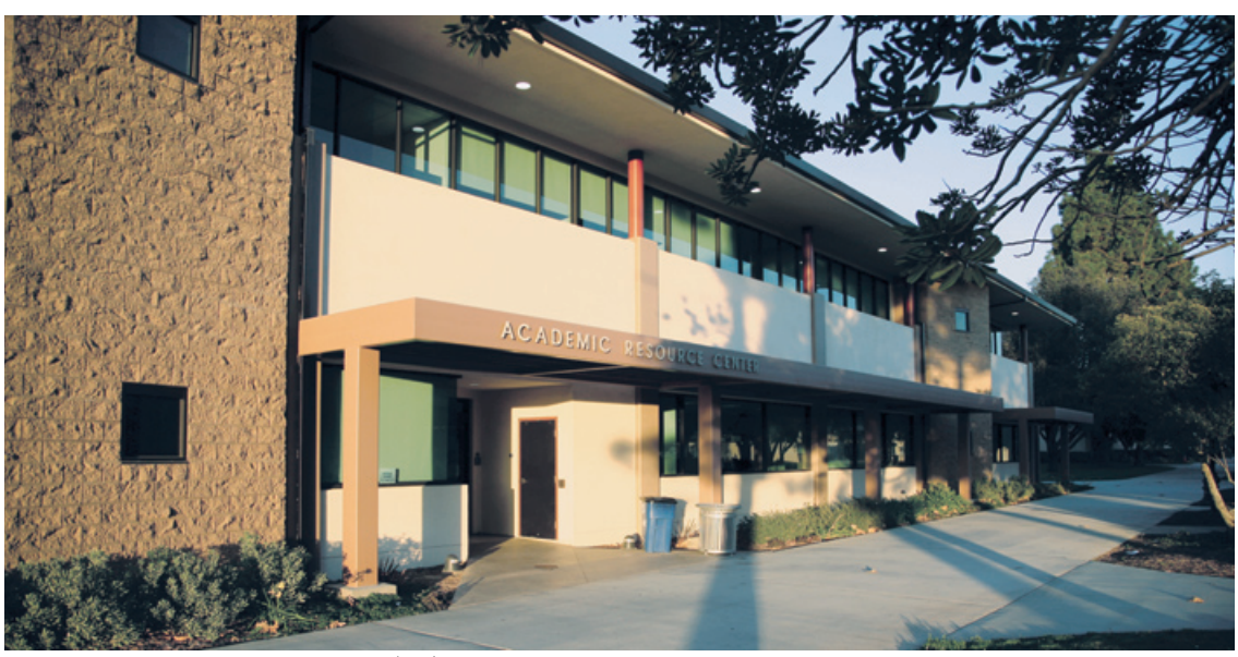
Building L South, Academic Resource Center (ARC)

view to district and to DSA for plan check approval