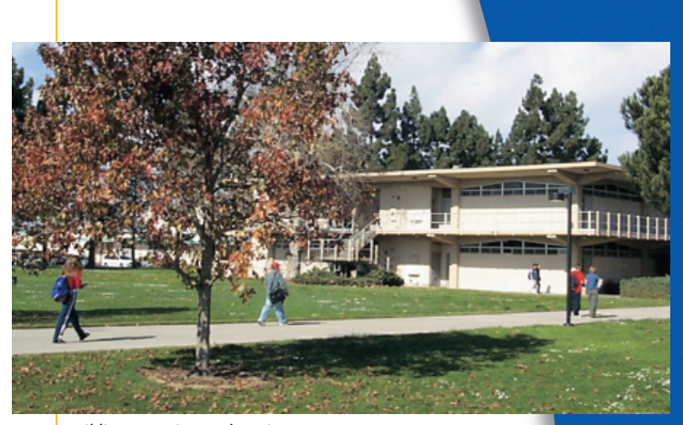
Building K, Business Education

Measure I was presented to voters under the provision of Proposition 39, stipulating that at least 55 percent of voters approve a measure for its passage. It passed by 56.9 percent of the vote.