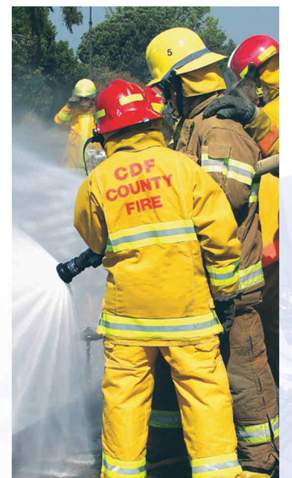
Fire science training

Vavrinek, Trine, Day & Co., LLP stated, "In our opinion, the financial statements referred to above present fairly, in all material respects, the financial position – modified accrual basis – of the Measure I General Obligation Bond of Allan Hancock Joint Community College District as of June 30, 2008, and the results of its operations – modified accrual basis – for the year then ended."