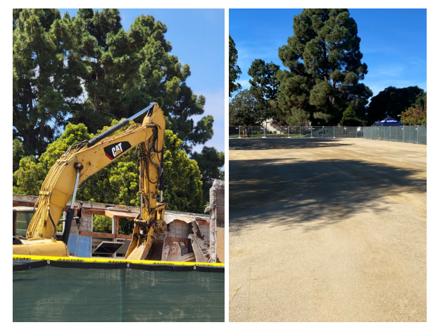
Buildings E & F during and after demolition.