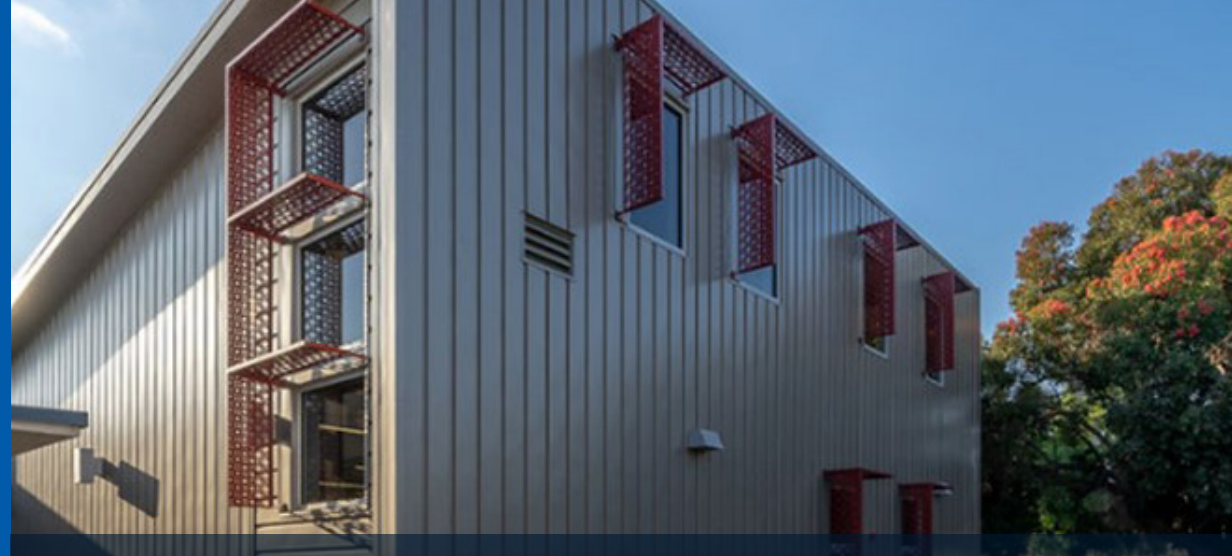
The new PCPA Stagecraft building is located at the northwest corner of the Santa Maria campus.