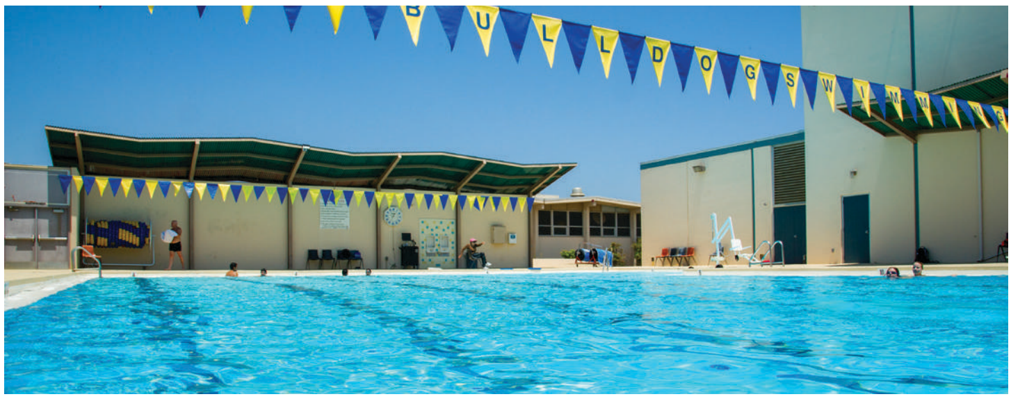
AHC Campus Swimming Pool