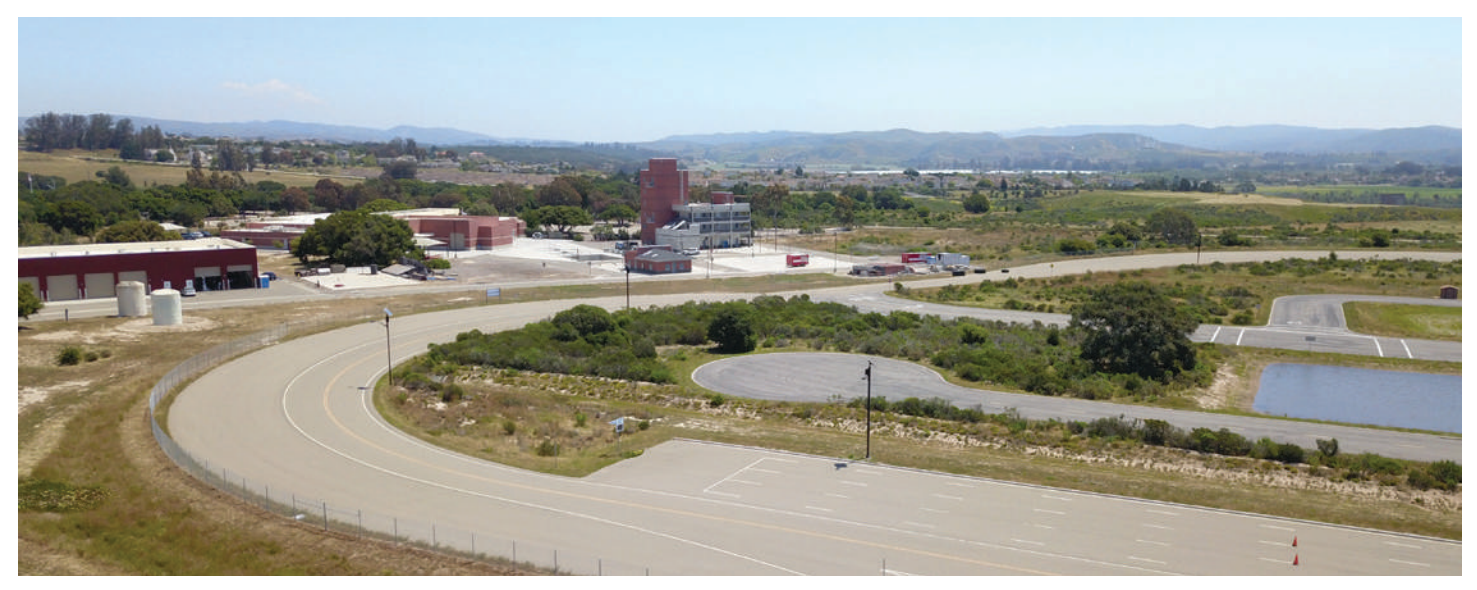
Public Safety Training Center