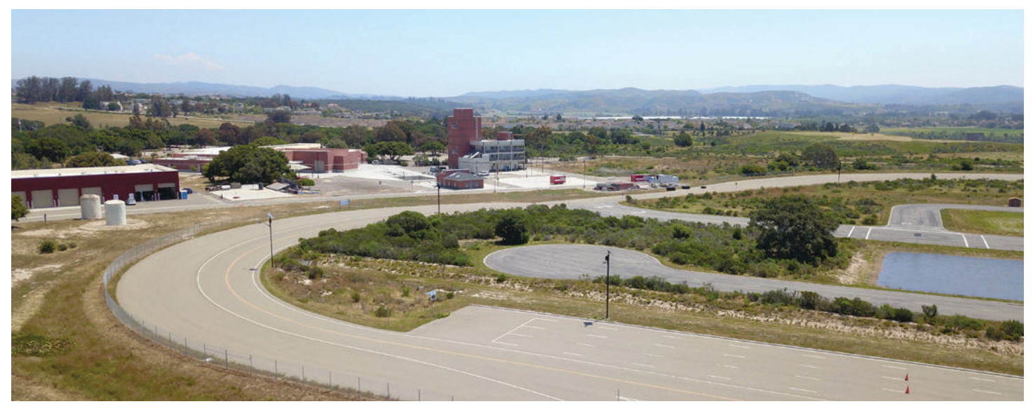
Public Safety Training Center