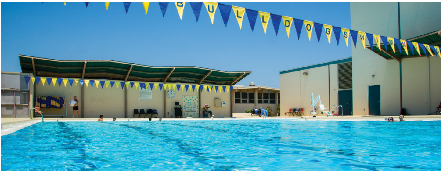
AHC Campus Swimming Pool

Completed Scheduled Maintenance Total: $13,913,739