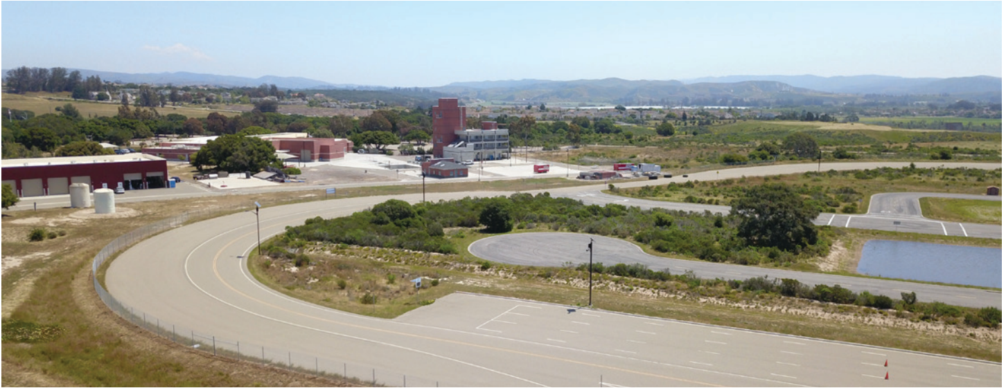
Public Safety Training Center