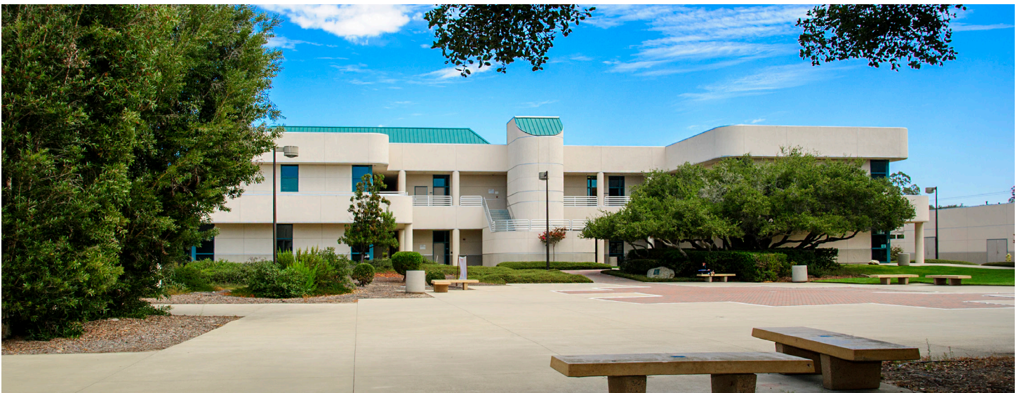
Lompoc Valley Center

Completed Scheduled Maintenance Total: $13,913,739