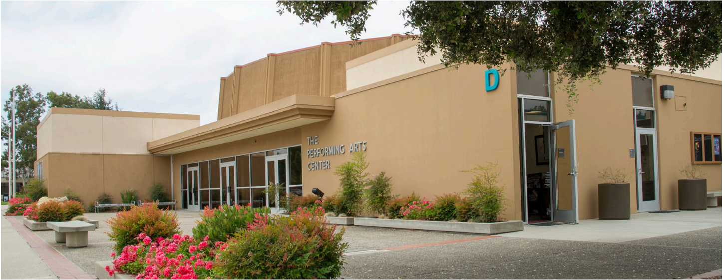
PCPA Performing Arts Center