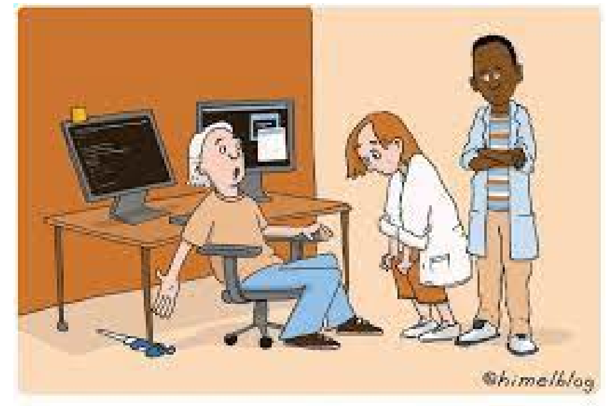
"I use my micropipette every day!"

Example: Research requestees will receive responses within 5 business days to assure the ability to effectively serve institutional needs.