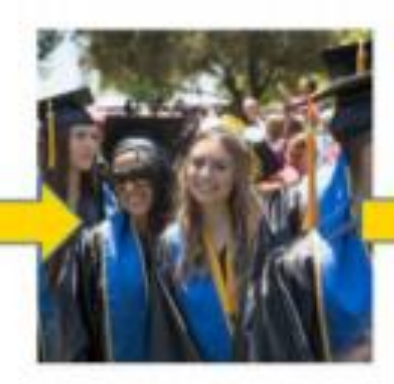
COMPLETION Complete Course of Study through Earning a Credential with Labor Market Value