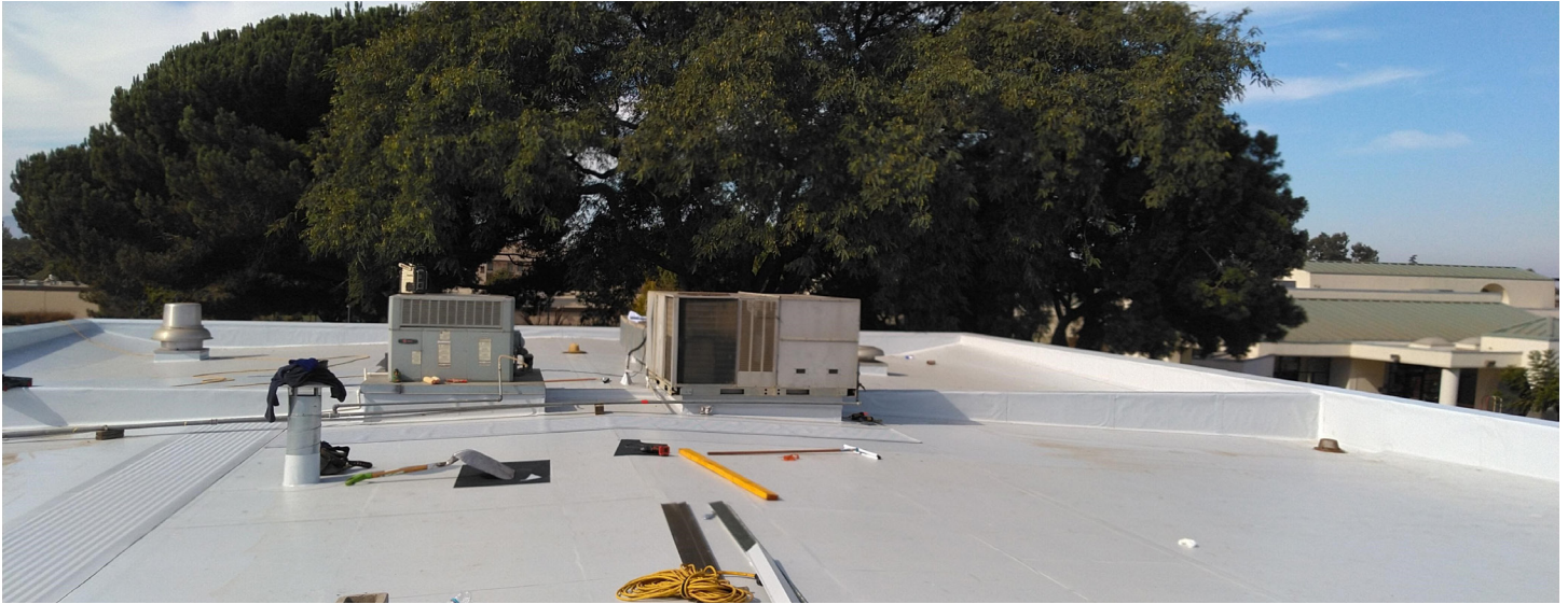
Building H Roof Replacement