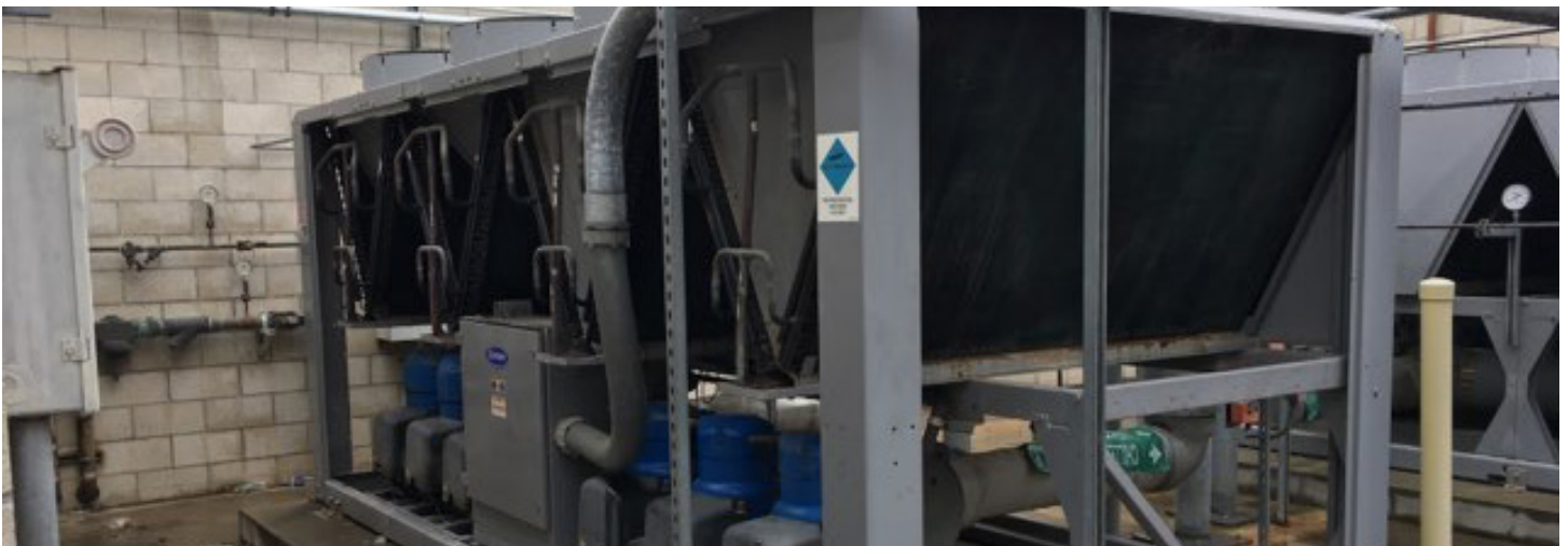
Replacement of the chiller units, Lompoc Valley Center

Completed Scheduled Maintenance Total: $13,913,739