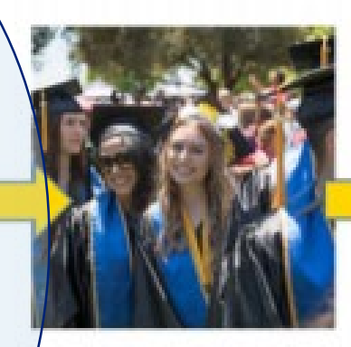
COMPLETION Complete Course of Study through Earning a Credential with Labor Market Value