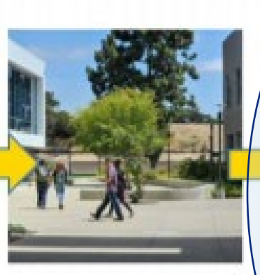
ENTRY Enrollment through Completion of "Gatekeeper" Courses