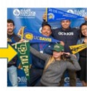
TRANSITION Movement to Four-Year University or to Workplace with Living Wage