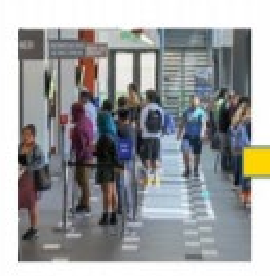
CONNECTION Initial Interest through Submission of Application