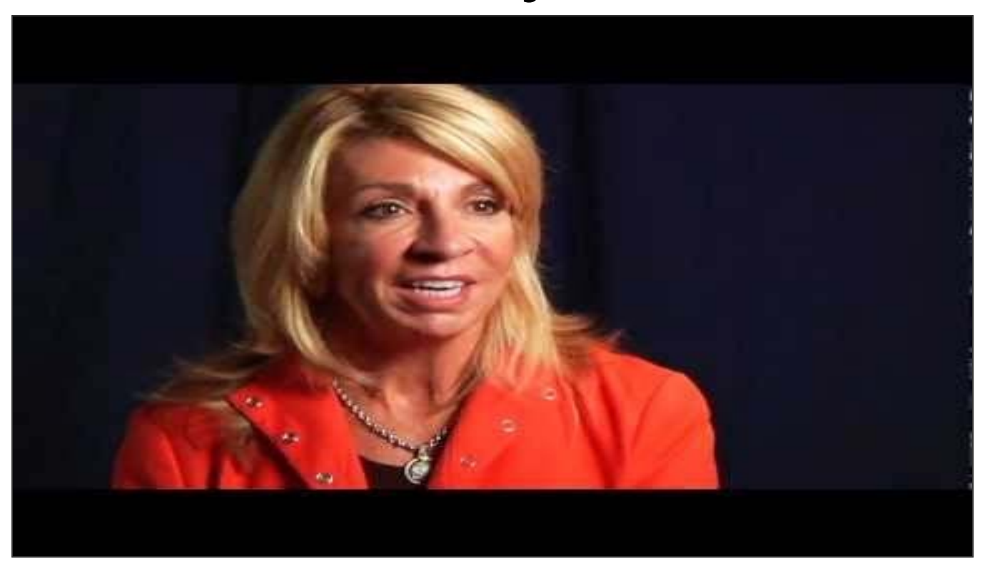
If play prompt does not appear, please click in the center of the slide.